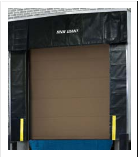
BGDSHS Stationary Dock Shelter