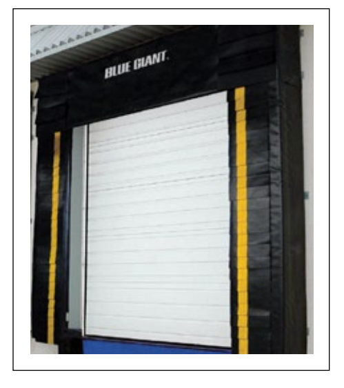
BGDSFA Full Access Dock Seal