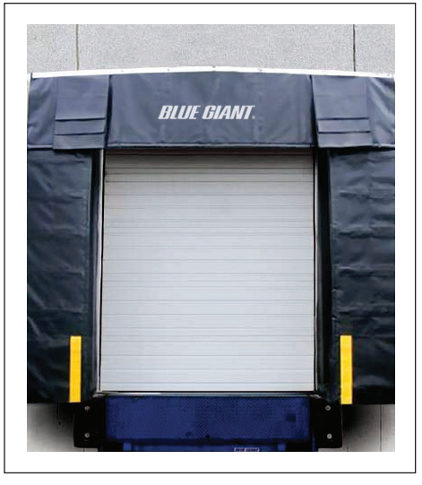
BGDSHF Foam Dock Shelter